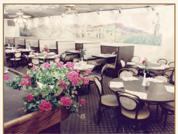
Original El Charro location established 1971.